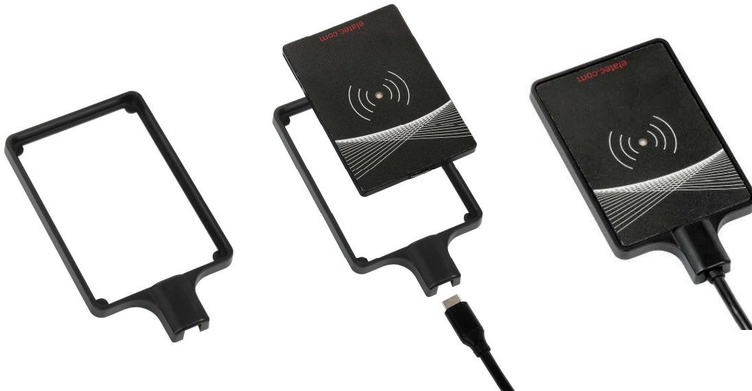
TWN4 Slim Mounting Frame Front View